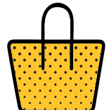
PATTERNED PLASTIC BAG